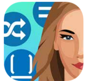
English 300 Bento

Answers and interactive app available at www.shortsnaplearning.com